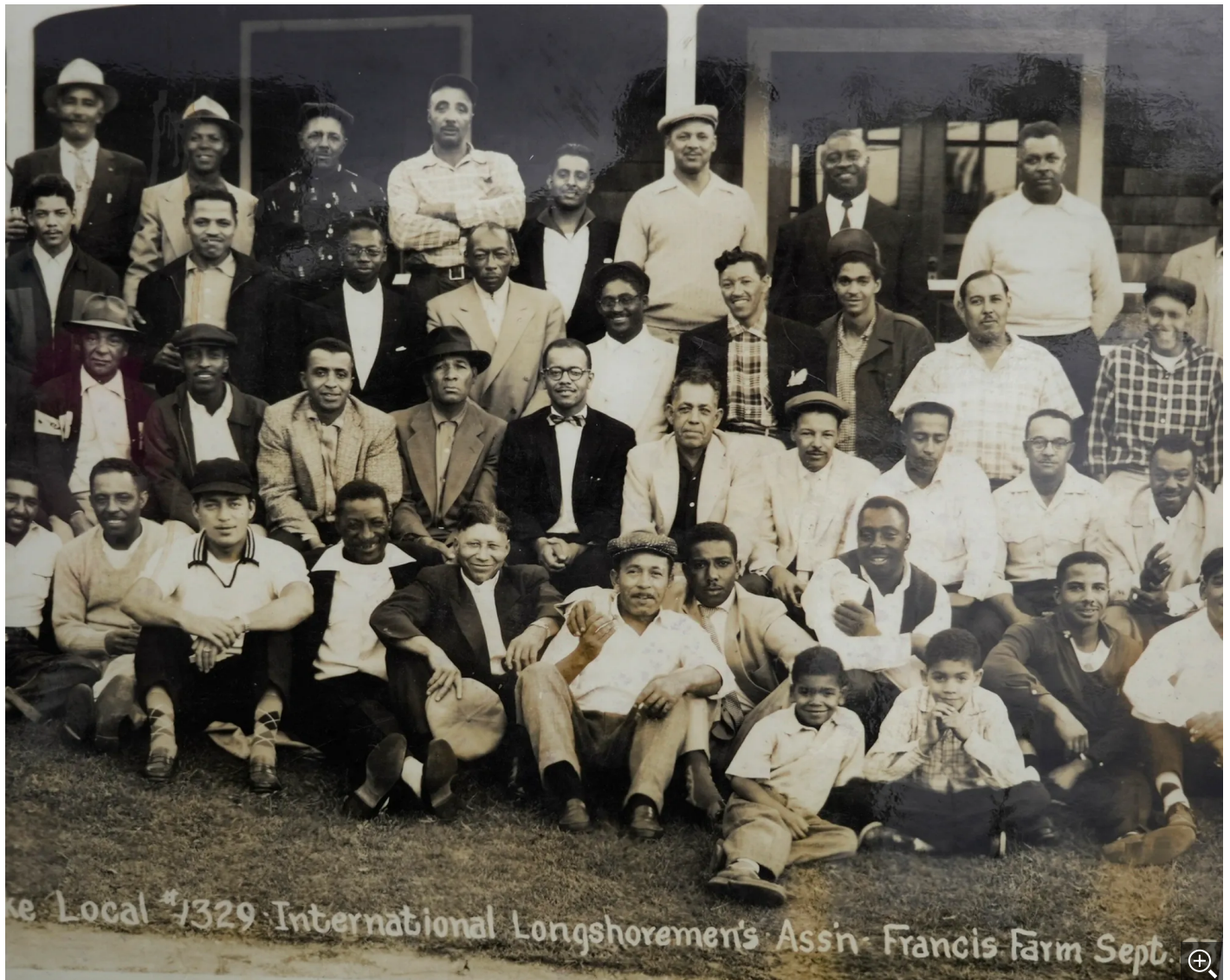
A photo shows members of Local 1329 of the International Longshoremen's Association in Providence's Fox Point before Route 195 construction uprooted the Cape Verdean neighborhood.

This year, the community displaced by outside forces received recognition from the Providence Preservation Society. The group identified the Tockwotton Fox Point Cape Verdean Community as one of the city's Most Endangered Properties, noting "the loss of a neighborhood is not as simple as a wrecking ball."